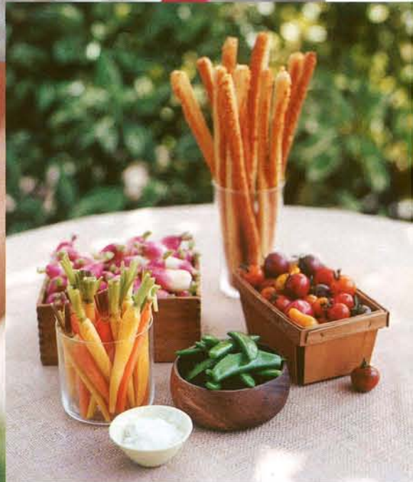
Opposite, from top: The couple's stationery used eco-friendly paper for the invitation suite; the honeycomb and flower theme was woven through the entire day. The newlyweds pose with family before the ceremony. This page, clockwise from top left: Gail and Jeremy exchange vows under a wood and cloth huppa with quince branches and passionflower vines. Guests sipped peach-mint iced tea and strawberry lemonade. One of the favors: a farmers' market tote bag. Radishes, carrots, parsnips, snap peas, and tomatoes were ripe for the eating during cocktail hour. Dinner-plate dahlias, roses, zinnias, geraniums, and ornamental oregano made for a summery bouquet.